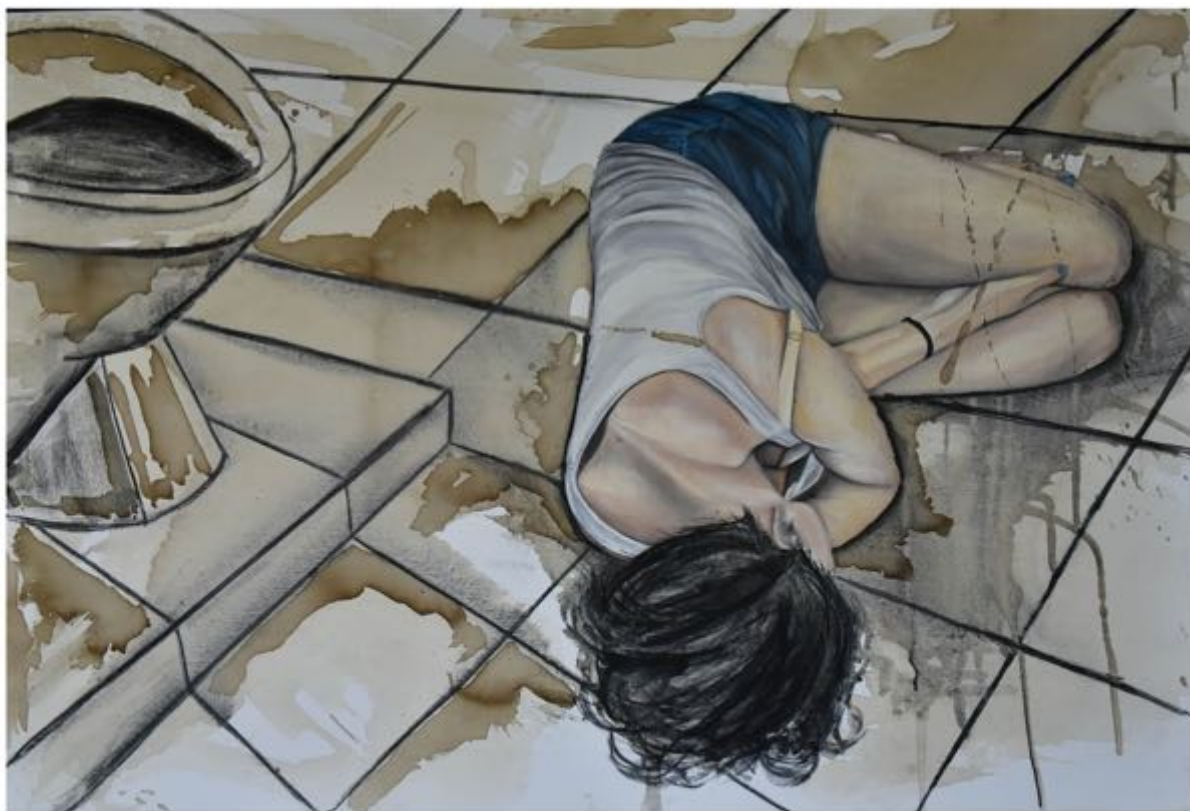
Untitled 5 36 x 54 cm (3ft x 4.6ft) Oils, Charcoal, and Coffee Stain on Canvas