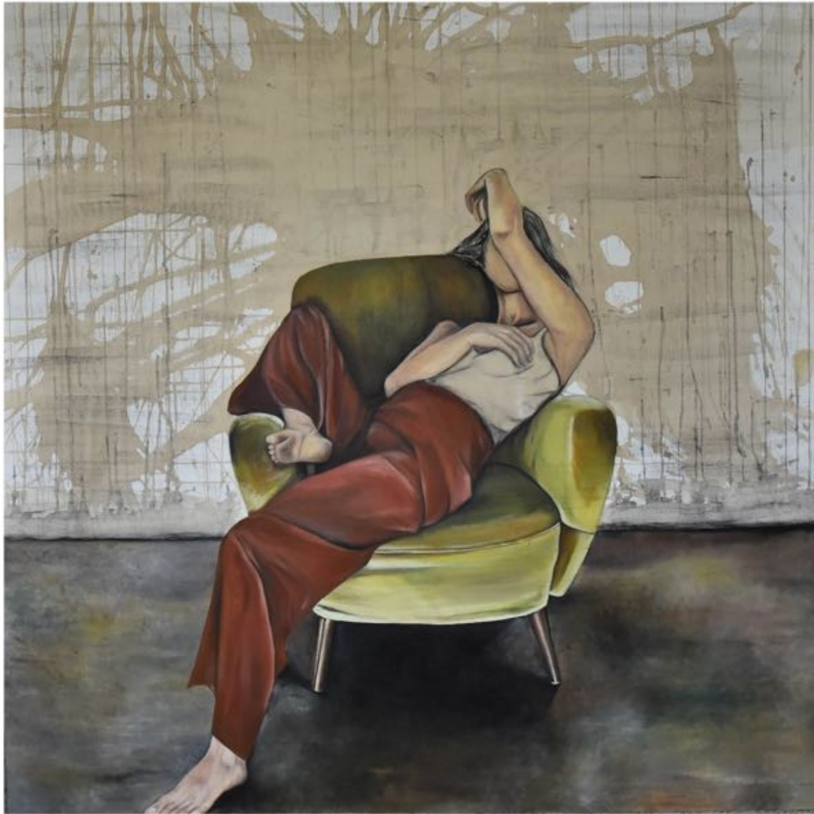
Untitled 2 153 x153 cm (5ft x 5ft) Oils, Charcoal, and Coffee Stain on Canvas