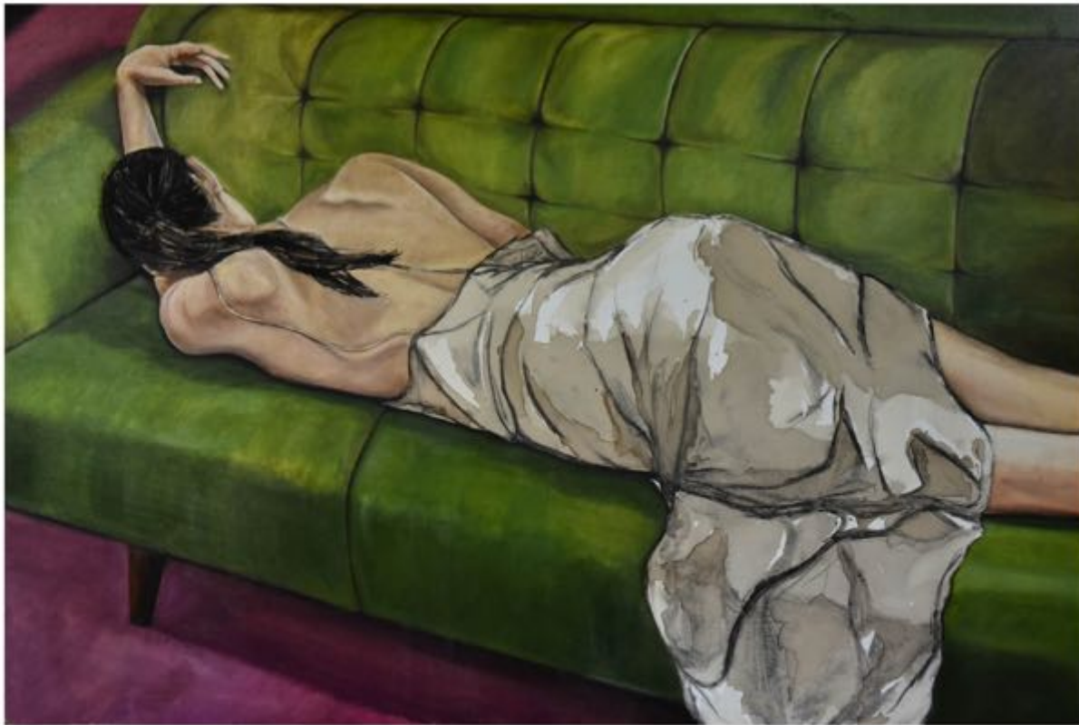
Untitled 5 36 x 54 cm (3ft x 4.6ft) Oils, Charcoal, and Coffee Stain on Canvas