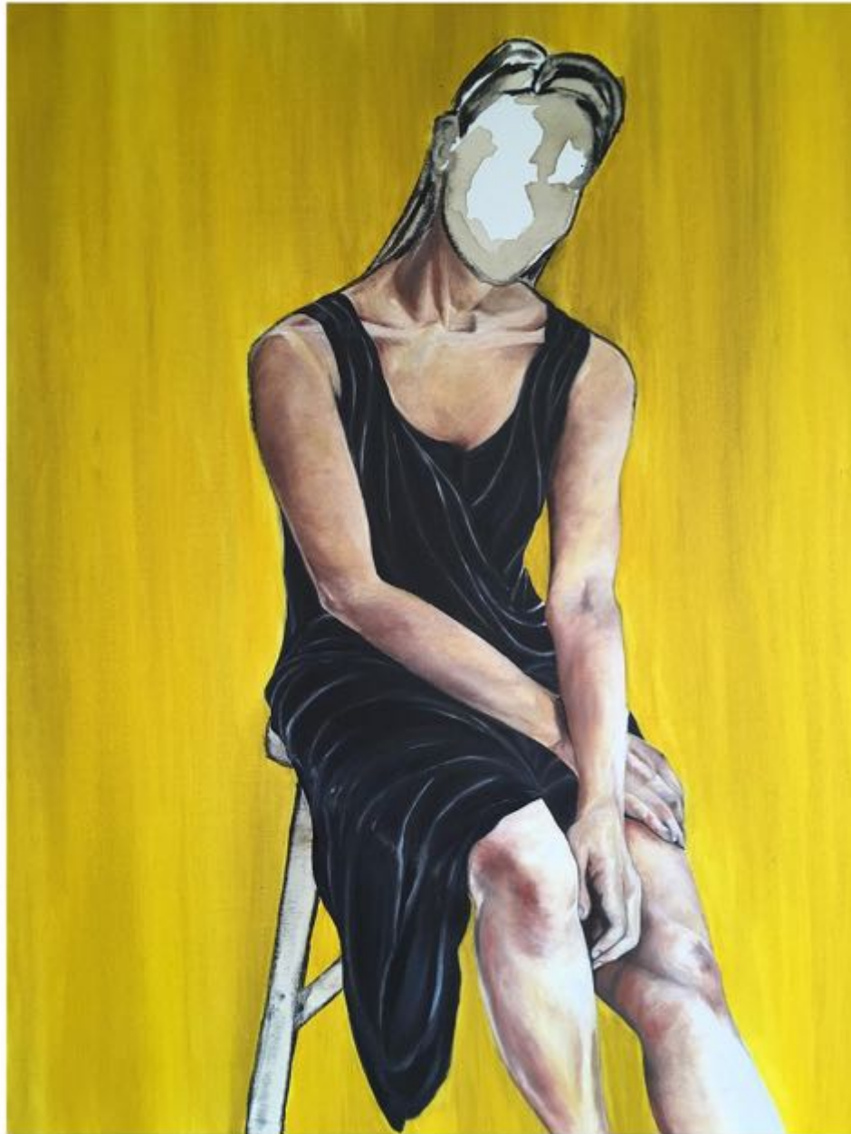
Untitled 16 30x 40 cm (2.6 x 3.4 ft) Oils, Charcoal, and Coffee Stain on Canvas