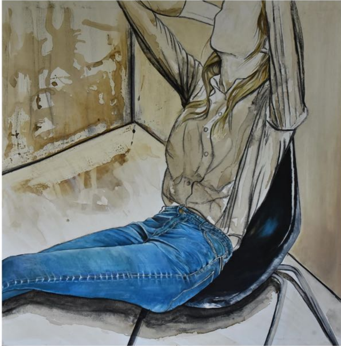
Untitled 1 122 x122 cm (4ft x 4ft) Oils, Charcoal, and Coffee Stain on Canvas