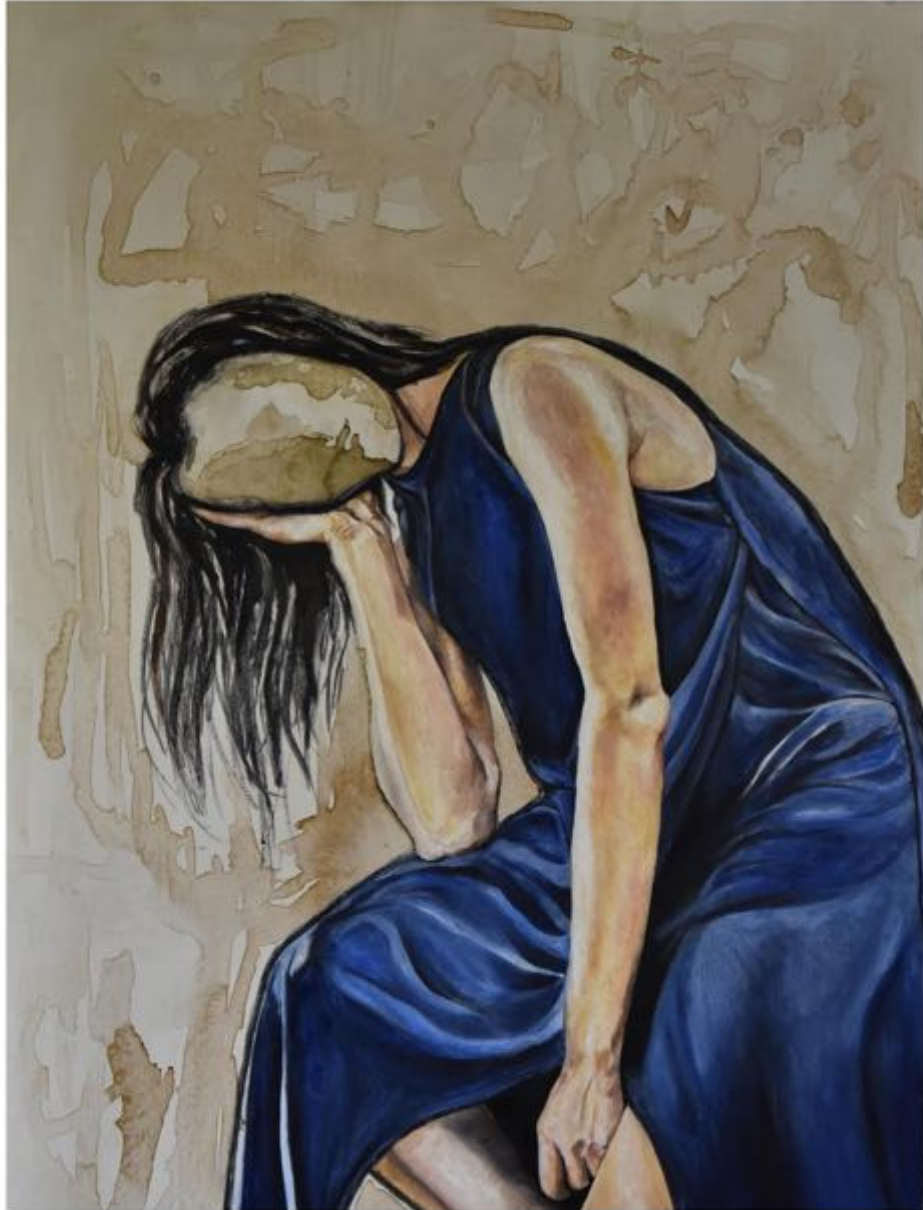
Untitled 4 42 x 30 cm (3.7ft x 2.6ft) Oils, Charcoal, and Coffee Stain on Canvas