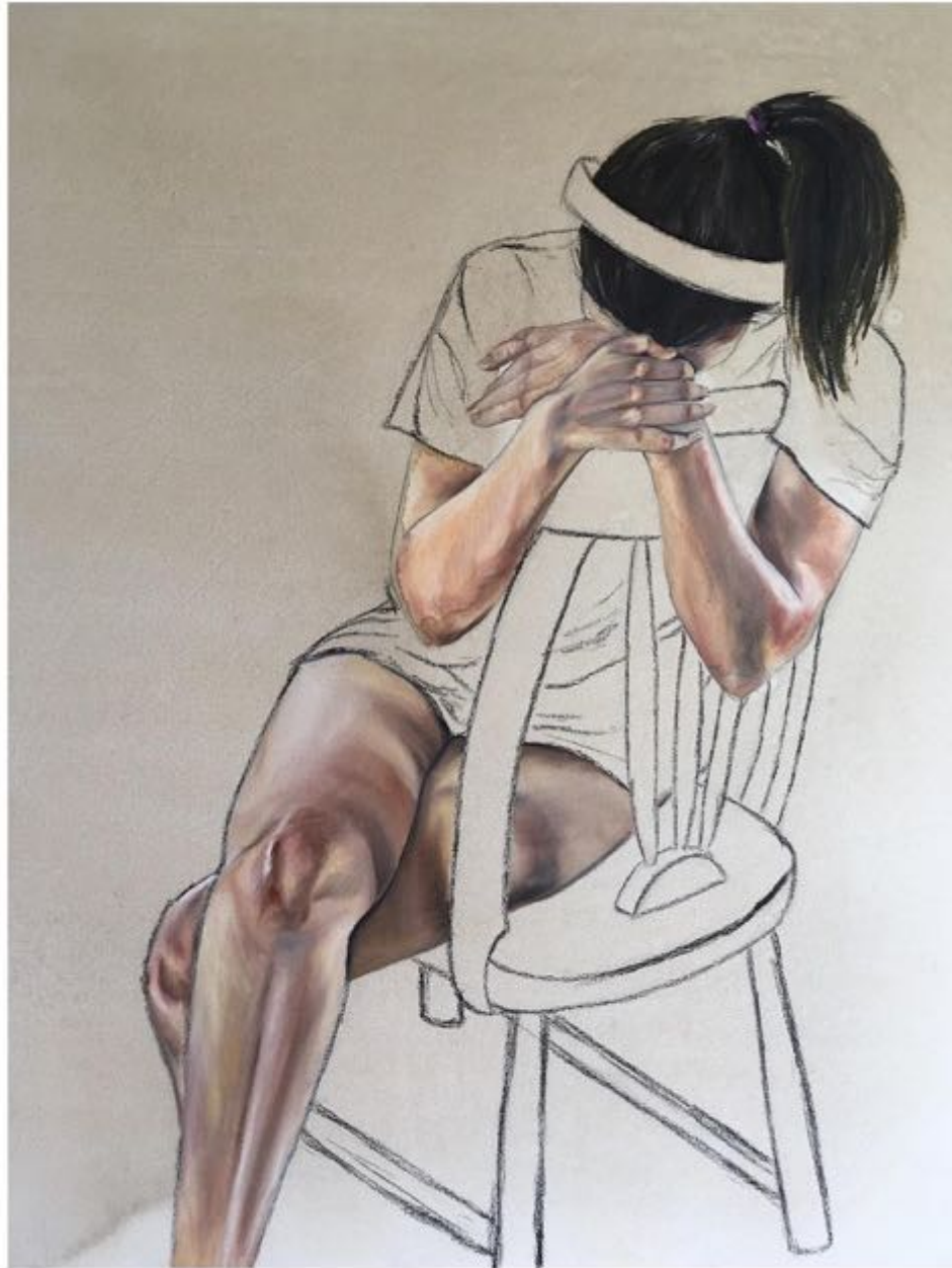
Untitled 15 30x 36 cm (2.6 x 3 ft) Oils, Charcoal, and Coffee Stain on Canvas