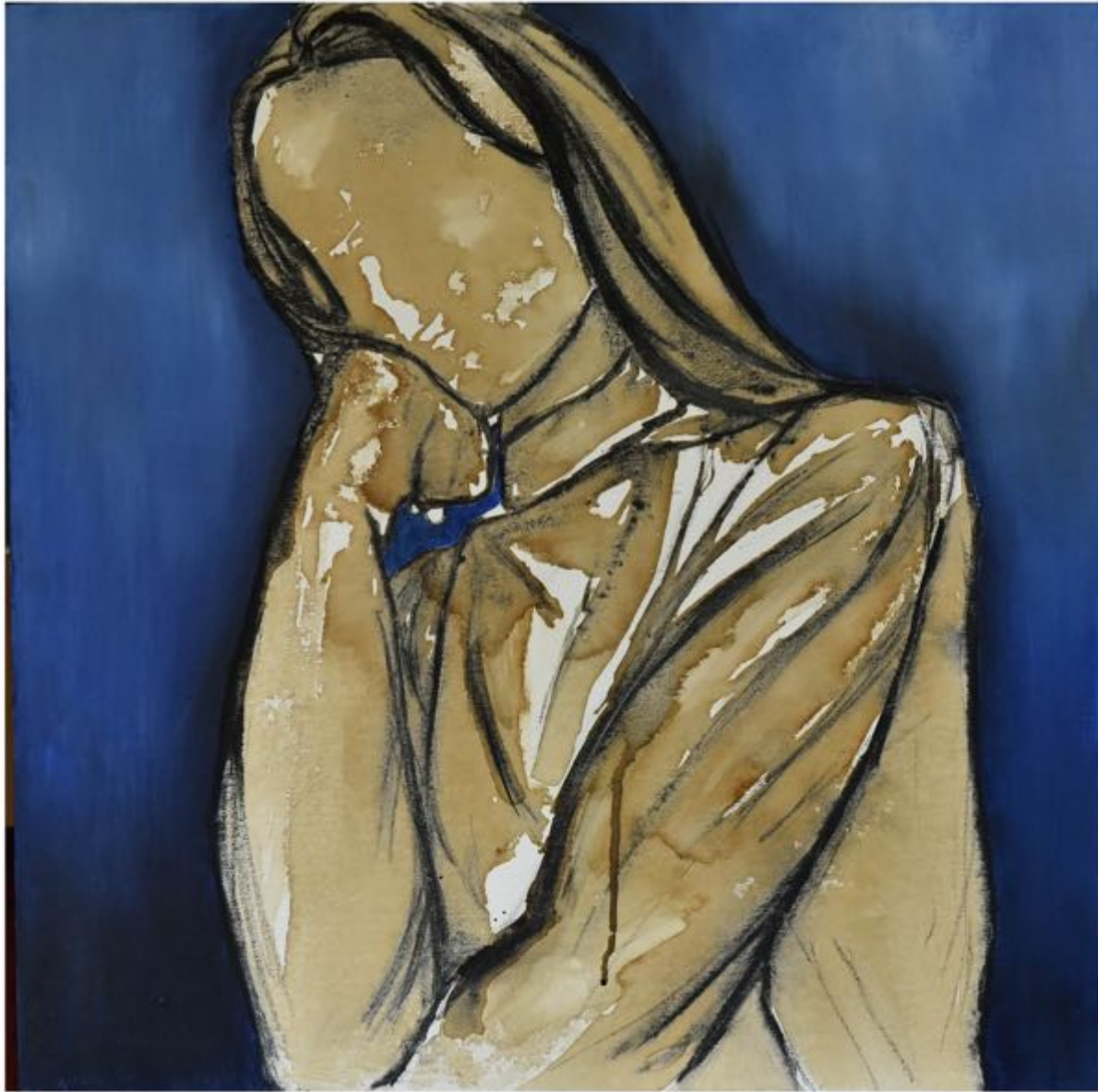
Untitled 14 26 x 26 cm (2.3 x 2.3 ft) Oils, Charcoal, and Coffee Stain on Canvas