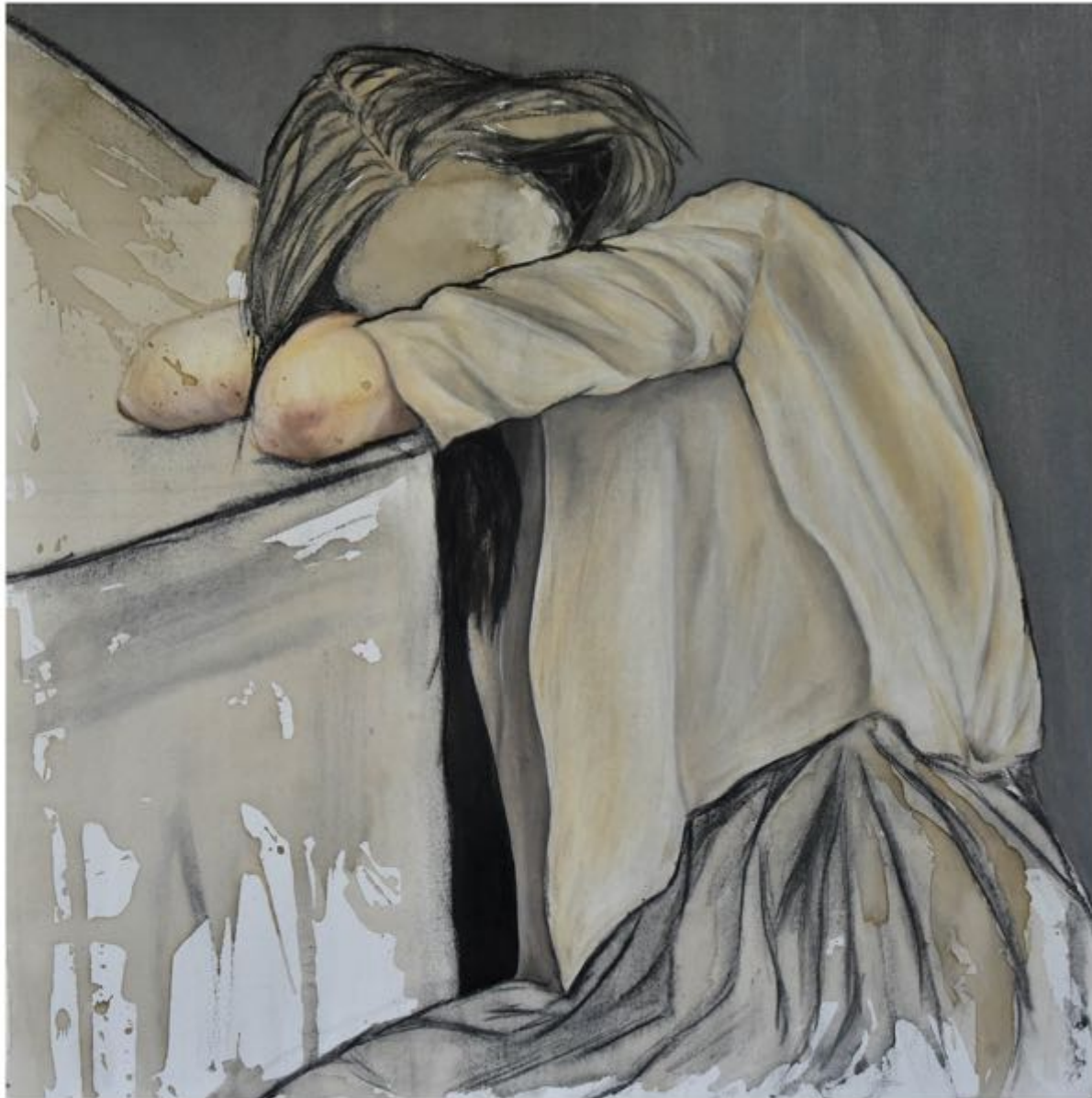
Untitled 12 36 x 36 cm (3ft x 3ft) Oils, Charcoal, and Coffee Stain on Canvas