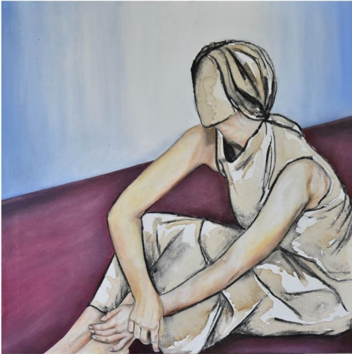
Untitled 9 30 x 30 cm (2.7 x 2.7 ft) Oils, Charcoal, and Coffee Stain on Canvas