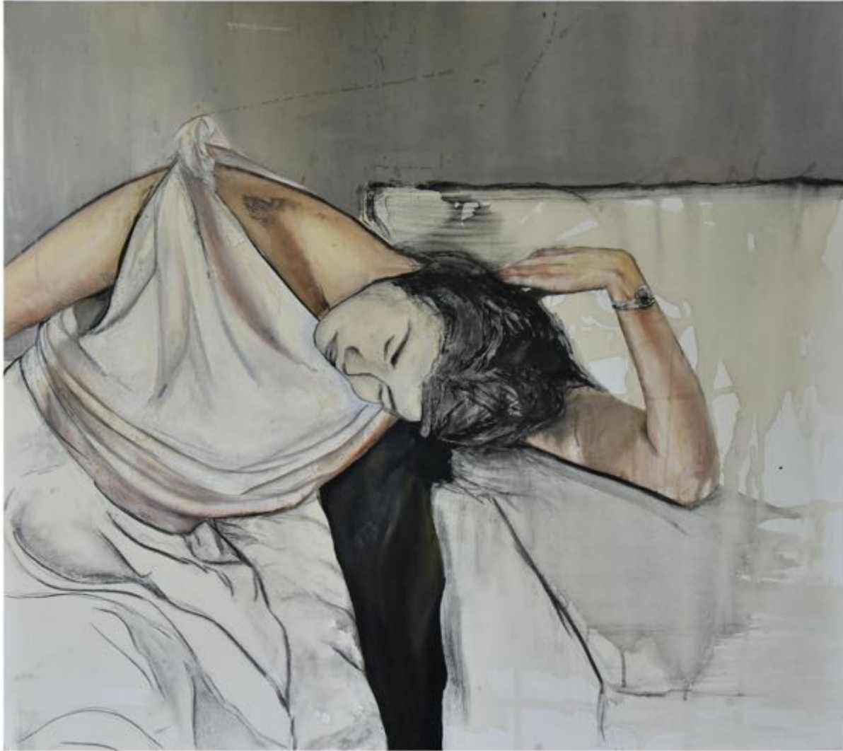
Untitled 3 42x48 cm x122 cm (3.6 x 4ft) Oils, Charcoal, and Coffee Stain on Canvas