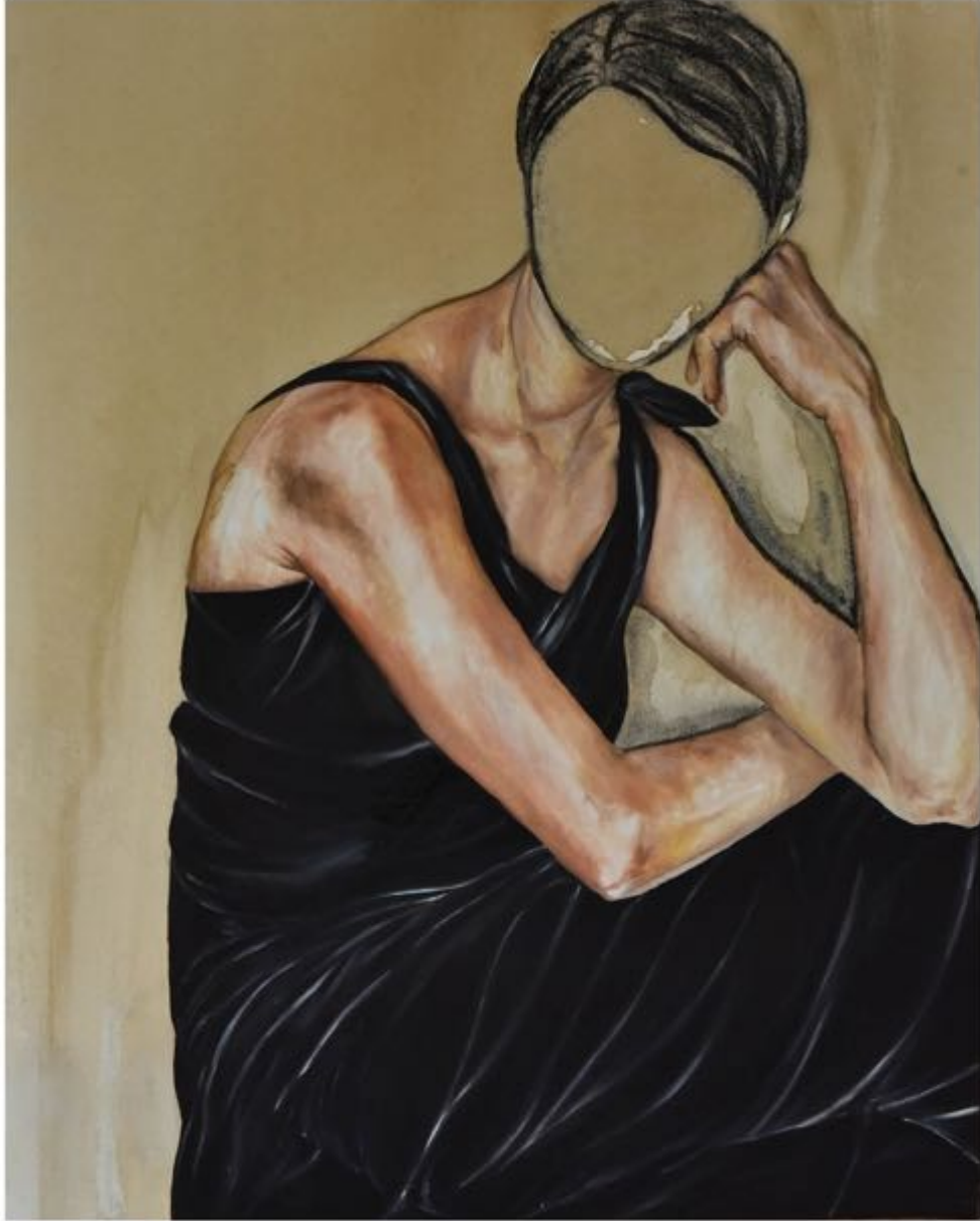
Untitled 8 24 x 30 (2ft x 2.7ft) Oils, Charcoal, and Coffee Stain on Canvas