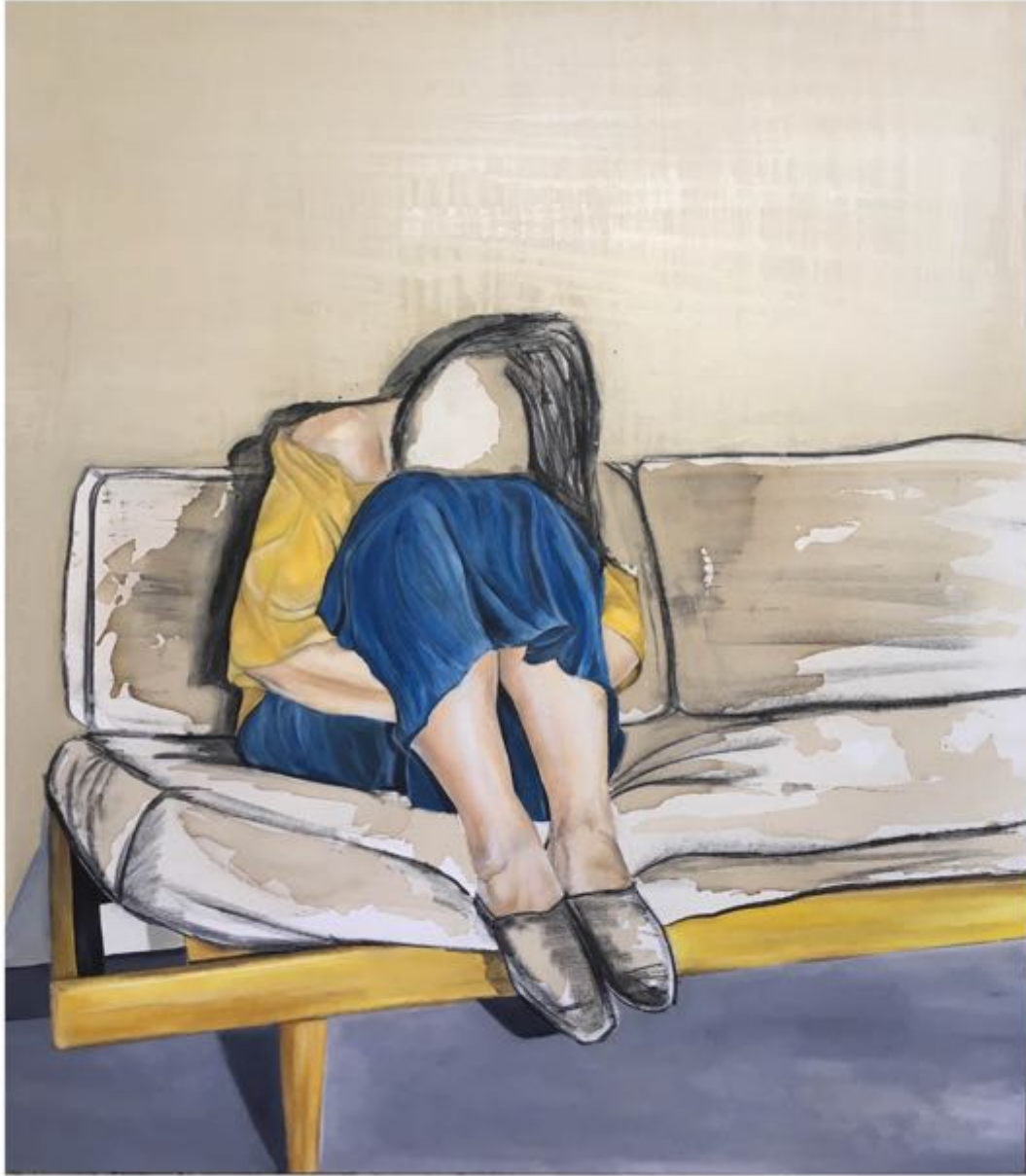
Untitled 11 48 x 42 cm (4ft x 3.6ft) Oils, Charcoal, and Coffee Stain on Canvas