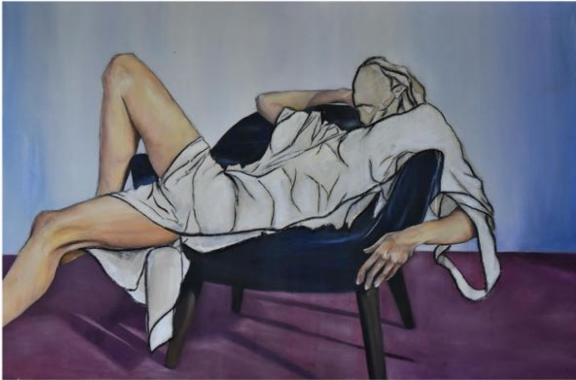
Untitled 5 36 x 54 cm (3ft x 4.6ft) Oils, Charcoal, and Coffee Stain on Canvas