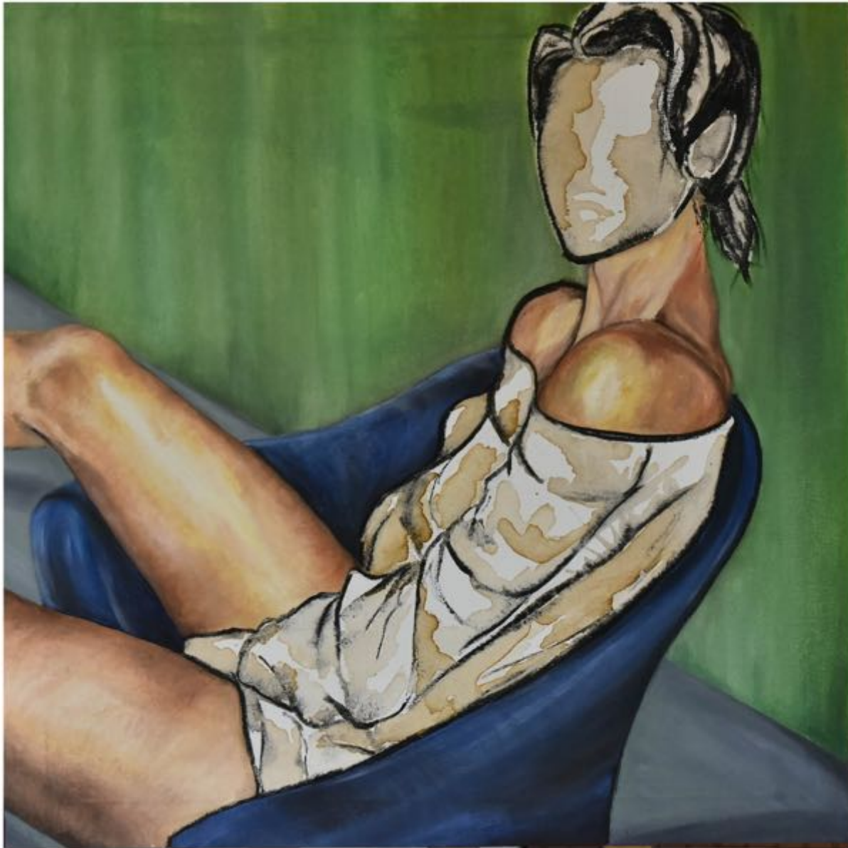
Untitled 10 26x26 cm (2.3 ft 2.3ft) Oils, Charcoal, and Coffee Stain on Canvas